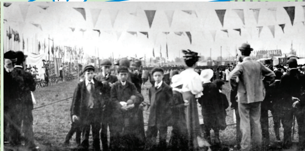
Wormwood Scrubs, August Bank Holiday 1907