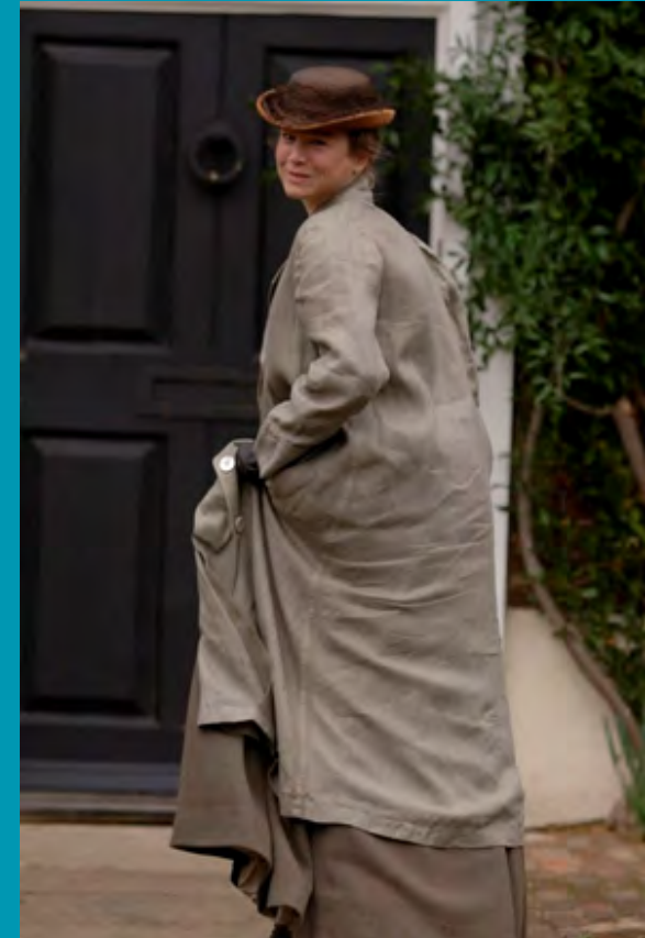
Miss Potter at St Peters Square