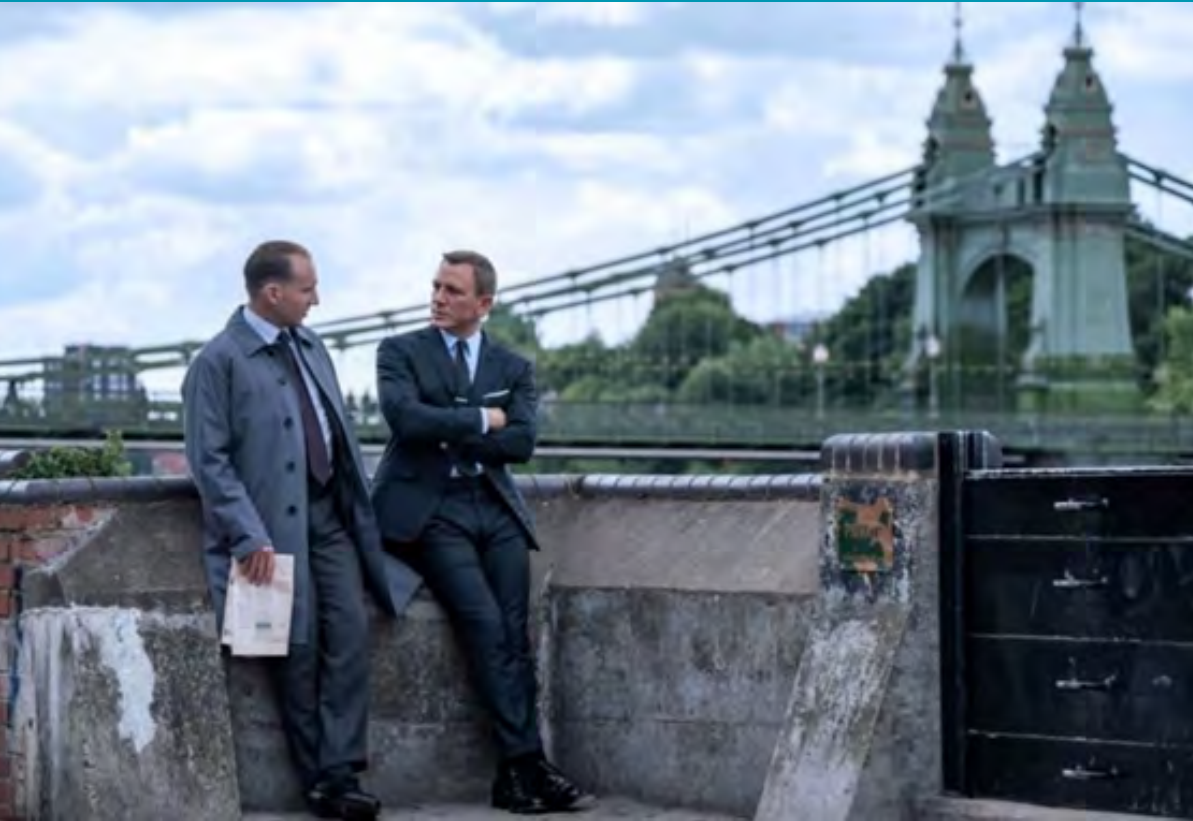
Bond 25 No Time to Die on Lower Mall

We have played host to a number of filming productions.