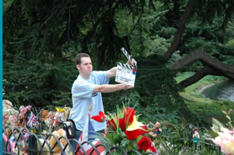
Gideons Daughter in Ravenscourt Park

All productions wishing to film on any council owned/looked after property and large crews intending to film on the highway must apply for permission to film. H&F along with many other councils use a web-based film application system called Filmapp www.filmapp.org.uk