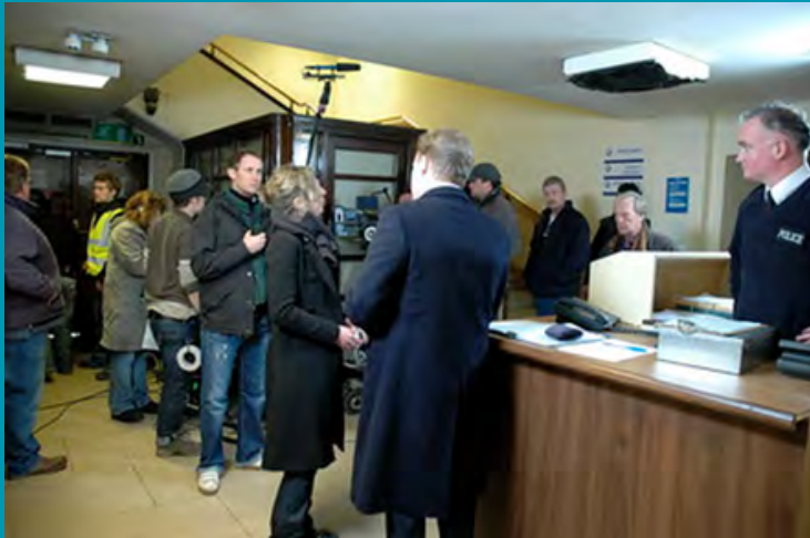
New Tricks at Hammersmith Town Hall