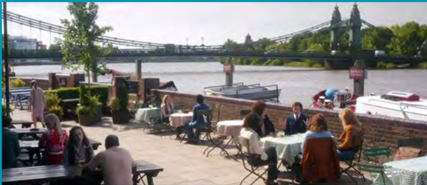
Bohemian Rhapsody on Lower Mall

The British Film Institute offers specific advice about tax relief and co-productions Advice for International Productions | Film London