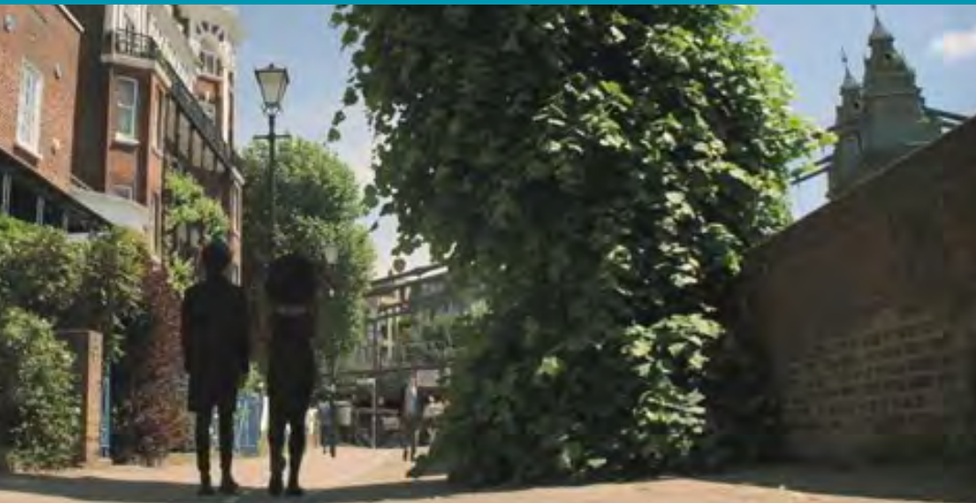
The Sandman on Lower Mall

Transport for London offer guidance on which roads fall under their jurisdiction Filming & photography on the roads - Filming & photography on the roads - Transport for London (tfl.gov.uk) Filming & photography on buses - Transport for London (tfl.gov.uk)