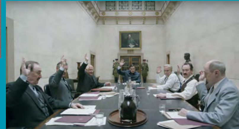
The Death of Stalin at Hammersmith Town Hall