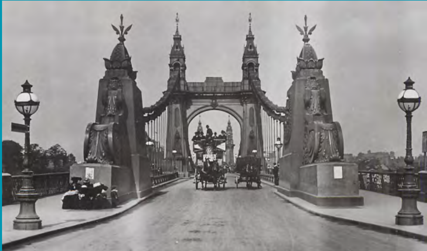
A horse and cart with passengers crossing Hammersmith Bridge during the Victorian era

We fully support filming in Hammersmith and Fulham. All productions wishing to film on any council owned/looked after property must apply for permission to film. All information on lead in times, parking, fees and charges, application forms etc can be found on our website Filming | LBHF