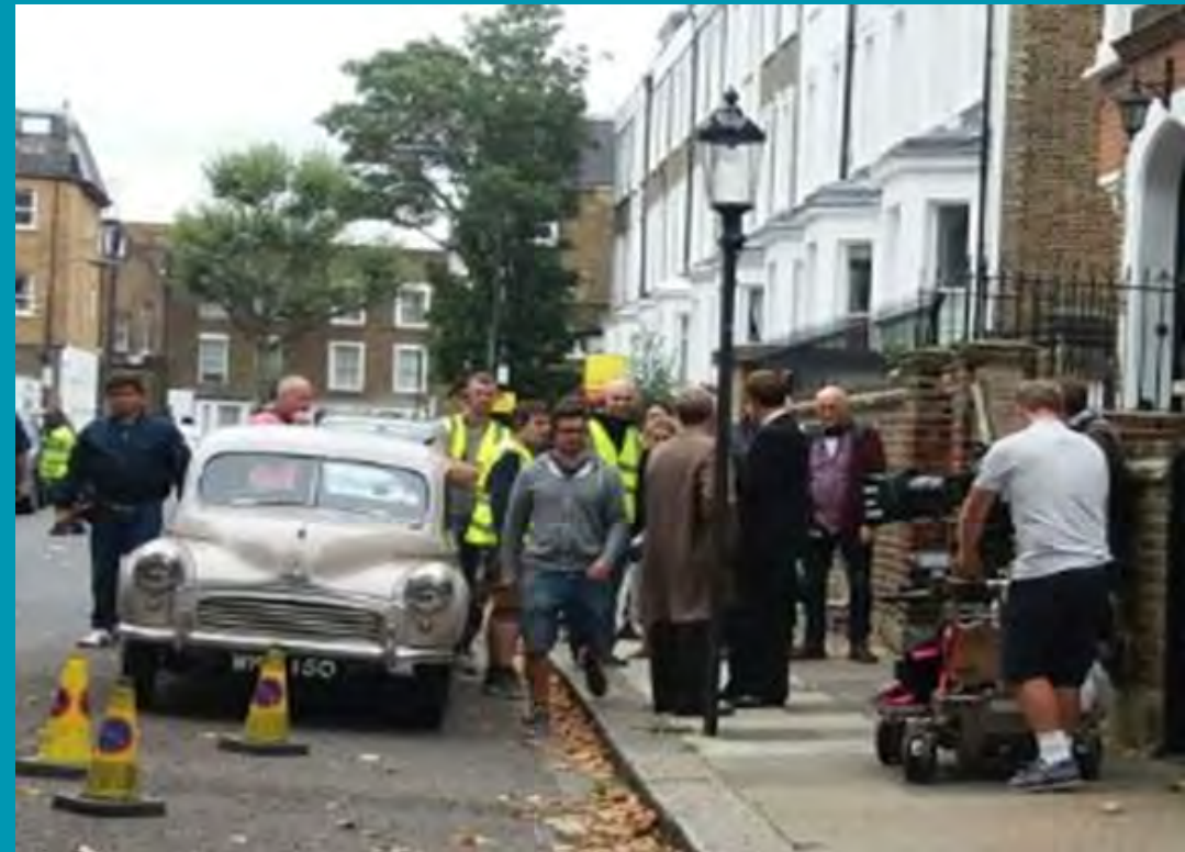
Grantchester on location in Fulham

We also ask you not to block public footpaths with vehicles.